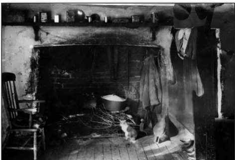
A hearth with firedogs and fittings and a high-backed settle.