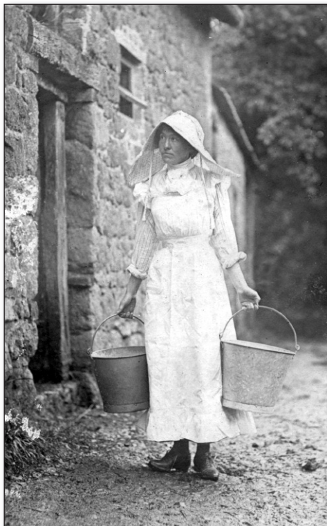
A milkmaid, 1907. Milking clothes had to be spotless and the hair covered.