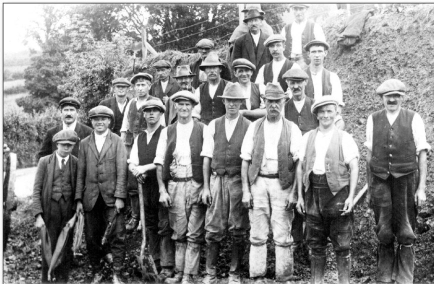
A group of Buckfastleigh farmhands in the 1930s, waistcoats and breeches still the common garb.