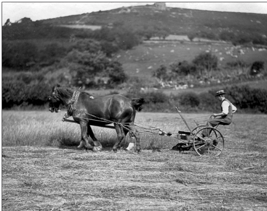
Right: A horse-drawn mower, c.1910.